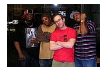
Me & Contraband